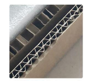
3CM Thickened Honeycomb Cardboard